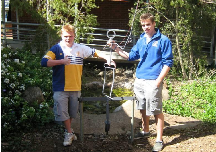
Year 12 Metal and Engineering students install a parting gift to GHS, an interactive kinetic sculpture entitled 'Fisherman', near the aquatic learning