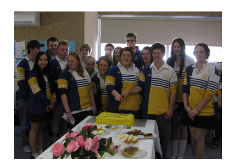
Year 12 – Cutting their first cake