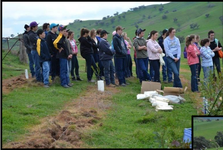
The Team briefing before they branch out into the various tasks.