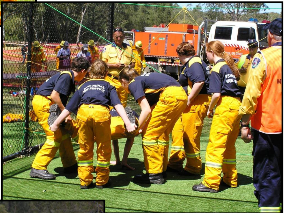
Negotiating the Spider Web in the team challenge.