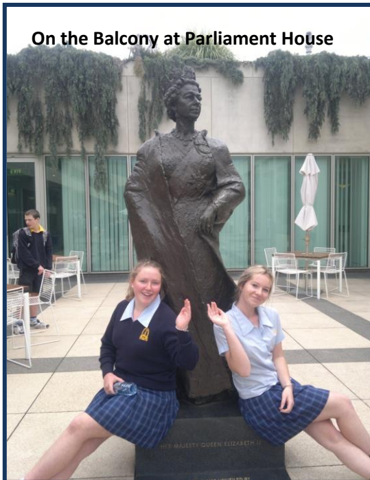
On the Balcony at Parliament House

Our visit to Parliament House allowed us to experience both the Senate and House of Representatives and learn some of the important history associated with the design and layout of these rooms, as well as some interesting facts about the functions of Parliament in Australia.