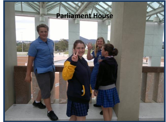
Above: At Parliament House