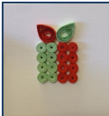
Sample of the cards made