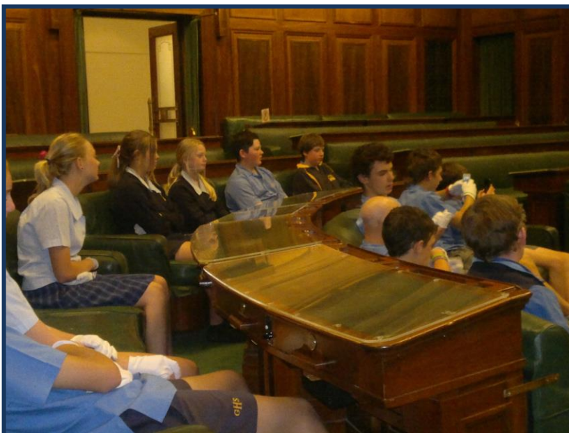
Left and Below: Role Playing at Parliament House