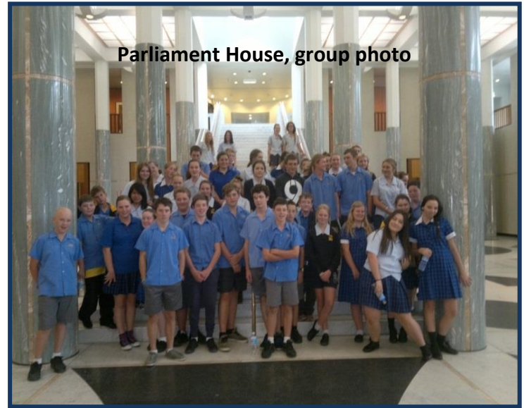
Parliament House, group photo

The PACER program encourages students' onsite learning about National democratic, historical and cultural institutions. Eligibility for funding depended upon having to travel >150km to Canberra and visiting Parliament House, Museum of Australian Democracy and the Australian War Memorial.