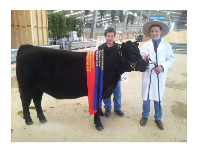
'Gazza" a steer donated by Abingdon Station