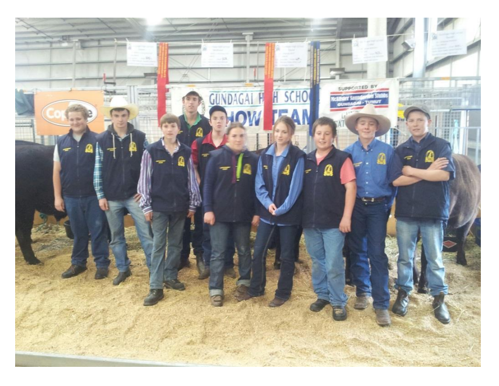
Team: The 2014 Melbourne Show Team