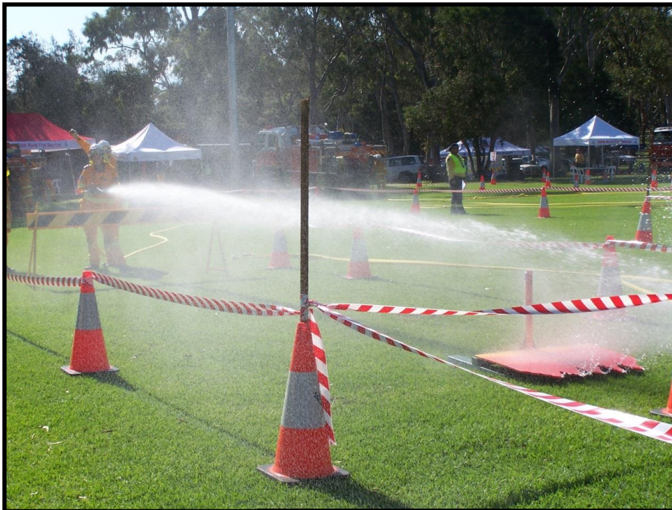
First target down