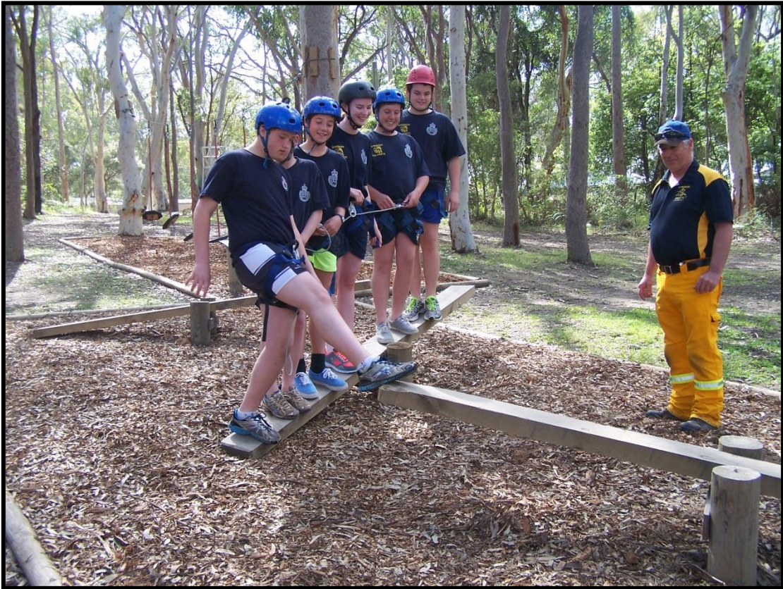
Team building by being roped together to complete a challenge course