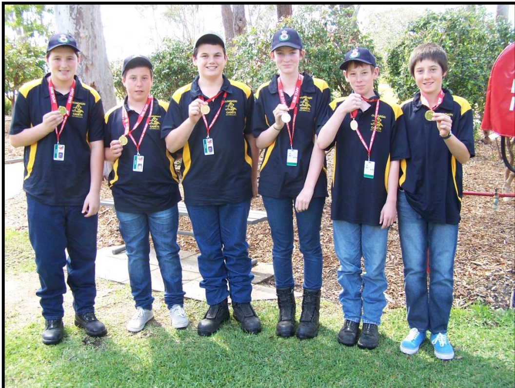
Gundagai High School RFS Cadet Team