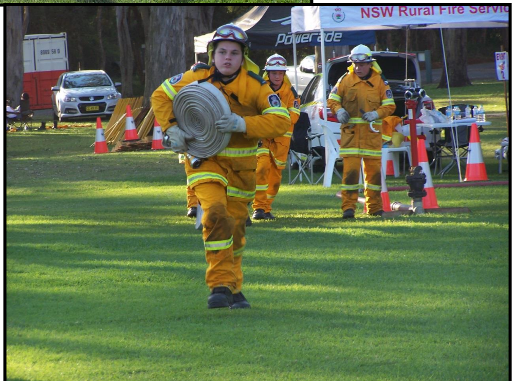
RFS Cadet in action