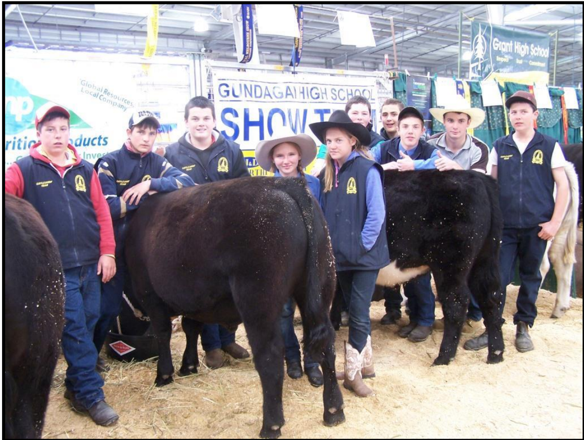
Gundagai High School Melbourne Show Team